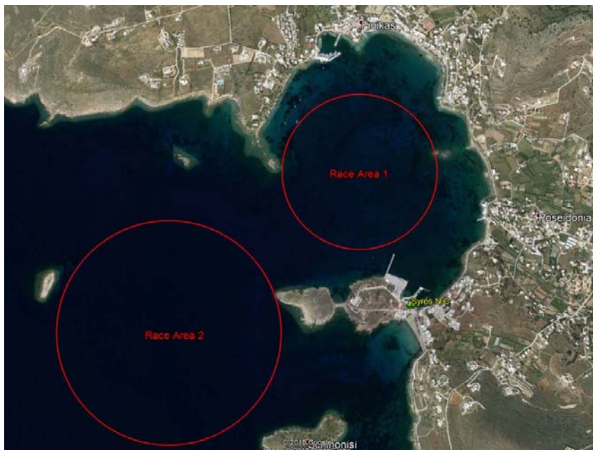
Foinikas Bay – Race Areas